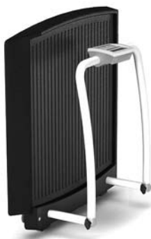
Wheelchair scale in folded position